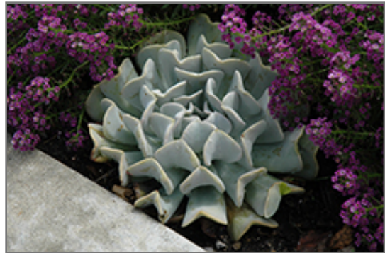
Topsy Turvy Echeveria

Topsy Turvy Echeveria is a dense herbaceous evergreen perennial with tall flower stalks held atop a low mound of foliage. Its relatively fine texture sets it apart from other garden plants with less refined foliage.