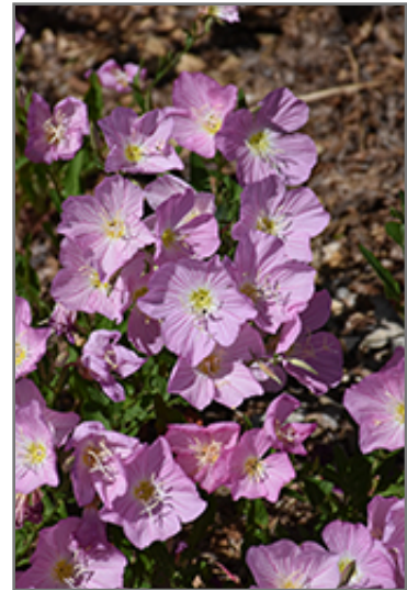
Twilight Evening Primrose flowers