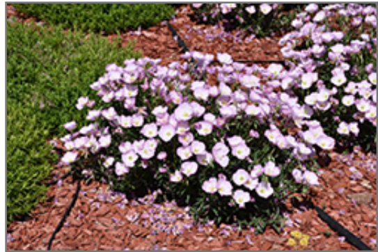
Twilight Evening Primrose in bloom

Twilight Evening Primrose is an herbaceous perennial with a ground-hugging habit of growth. Its medium texture blends into the garden, but can always be balanced by a couple of finer or coarser plants for an effective composition.