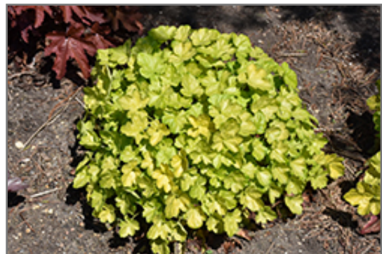
Dolce Appletini Coral Bells