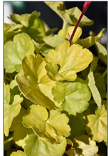
Dolce Appletini Coral Bells foliage

* This is a 'special order' plant - contact store for details