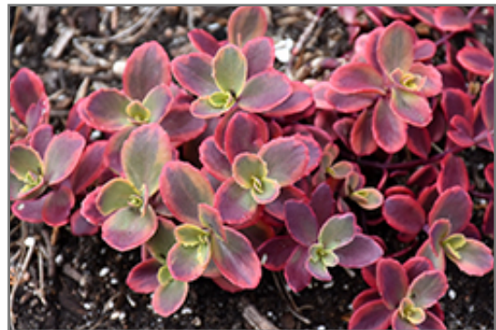
Sunsparkler Wildfire Stonecrop foliage