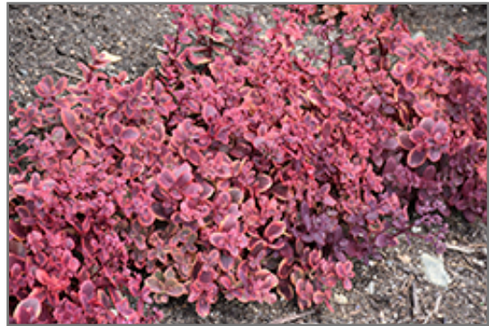
Sunsparkler Wildfire Stonecrop