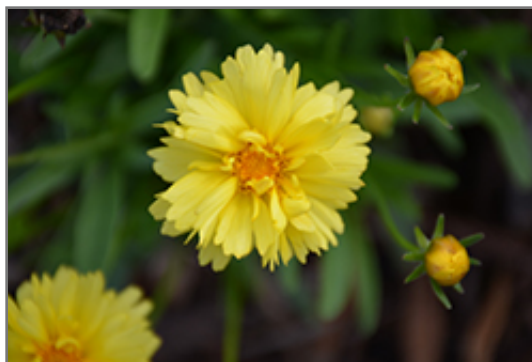
Leading Lady Charlize Tickseed flowers

Leading Lady Charlize Tickseed is recommended for the following landscape applications;