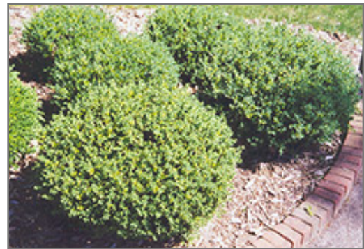
Japanese Boxwood