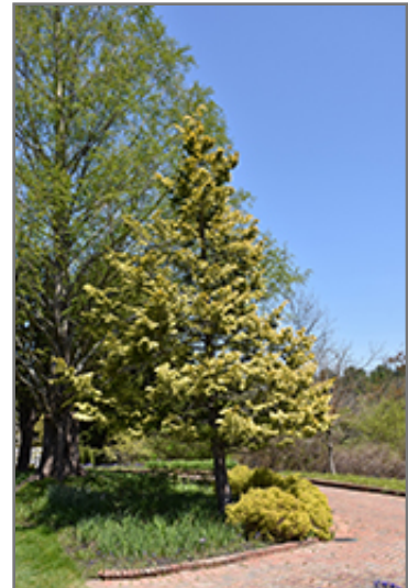
Cripps Gold Falsecypress

* This is a 'special order' plant - contact store for details