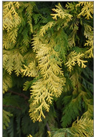
Cripps Gold Falsecypress foliage