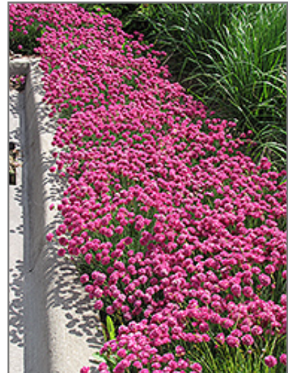
Dusseldorf Pride Sea Thrift in bloom

This is a relatively low maintenance plant, and may require the occasional pruning to look its best. Deer don't particularly care for this plant and will usually leave it alone in favor of tastier treats. It has no significant negative characteristics.