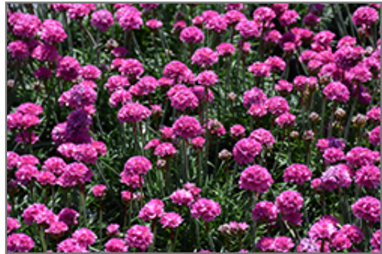
Dusseldorf Pride Sea Thrift flowers

Dusseldorf Pride Sea Thrift will grow to be only 6 inches tall at maturity extending to 8 inches tall with the flowers, with a spread of 8 inches. Its foliage tends to remain low and dense right to the ground. It grows at a slow rate, and under ideal conditions can be expected to live for approximately 10 years. As an evergreen perennial, this plant will typically keep its form and foliage year-round.