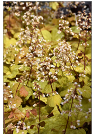
Champagne Coral Bells flowers