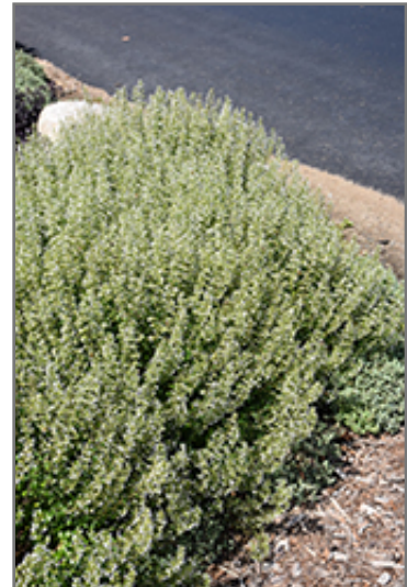
White Cloud Dwarf Calamint in bloom