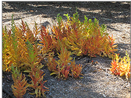
Campfire Crassula