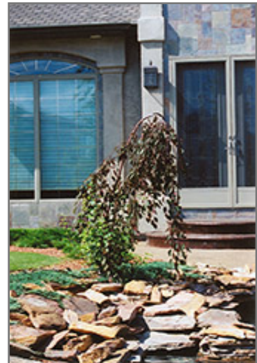
Royal Beauty Flowering Crab