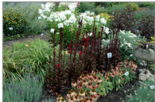
Vulcan Red Lobelia in bloom