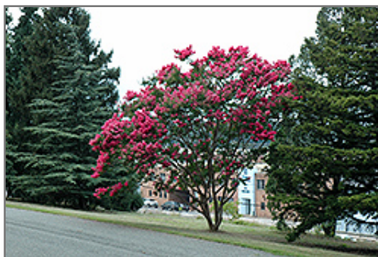
Seminole Crapemyrtle in bloom