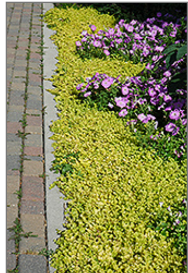
Golden Creeping Jenny