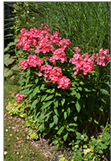
Flame Coral Garden Phlox in bloom