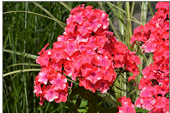
Flame Coral Garden Phlox flowers

Flame Coral Garden Phlox is a dense herbaceous perennial with an upright spreading habit of growth. Its medium texture blends into the garden, but can always be balanced by a couple of finer or coarser plants for an effective composition.