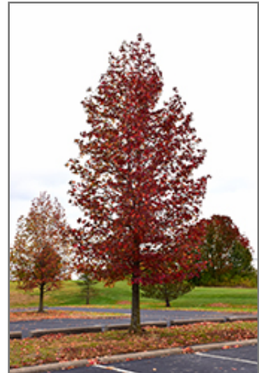
Happidaze Sweet Gum in fall