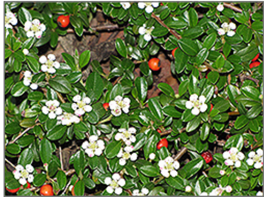
Coral Beauty Cotoneaster fruit