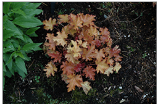
Zipper Coral Bells