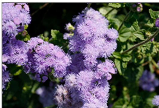
Blue Horizon Flossflower flowers

Blue Horizon Flossflower is a dense herbaceous annual with a mounded form. Its medium texture blends into the garden, but can always be balanced by a couple of finer or coarser plants for an effective composition.