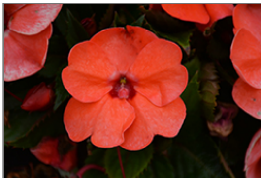
SunPatiens Compact Hot Coral New Guinea Impatiens flowers

SunPatiens Compact Hot Coral New Guinea Impatiens is a dense herbaceous annual with a mounded form. Its medium texture blends into the garden, but can always be balanced by a couple of finer or coarser plants for an effective composition.