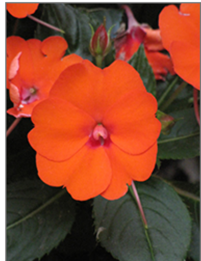
SunPatiens Compact Electric Orange New Guinea Impatiens flowers

SunPatiens Compact Electric Orange New Guinea Impatiens is a dense herbaceous annual with a mounded form. Its medium texture blends into the garden, but can always be balanced by a couple of finer or coarser plants for an effective composition.