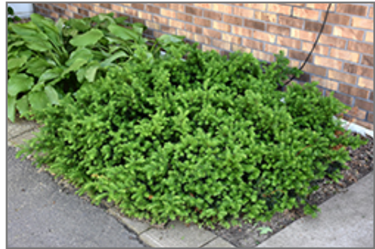
Emerald Spreader Yew

This shrub performs well in both full sun and full shade. However, you may want to keep it away from hot, dry locations that receive direct afternoon sun or which get reflected sunlight, such as against the south side of a white wall. It does best in average to evenly moist conditions, but will not tolerate standing water. It is not particular as to soil type or pH. It is highly tolerant of urban pollution and will even thrive in inner city environments, and will benefit from being planted in a relatively sheltered location. Consider applying a thick mulch around the root zone in winter to protect it in exposed locations or colder microclimates. This is a selected variety of a species not originally from North America, and parts of it are known to be toxic to humans and animals, so care should be exercised in planting it around children and pets.