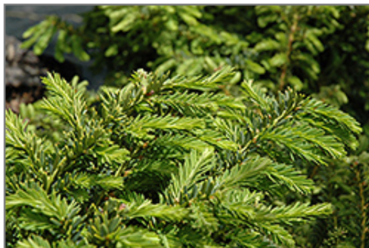
Emerald Spreader Yew foliage