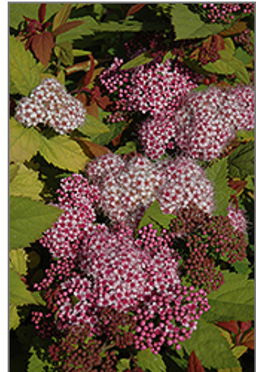
Double Play Big Bang Spirea flowers

This shrub will require occasional maintenance and upkeep, and is best pruned in late winter once the threat of extreme cold has passed. It is a good choice for attracting butterflies to your yard, but is not particularly attractive to deer who tend to leave it alone in favor of tastier treats. It has no significant negative characteristics.