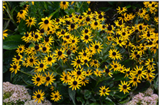
Little Goldstar Coneflower in bloom

Little Goldstar Coneflower is an herbaceous perennial with an upright spreading habit of growth. Its medium texture blends into the garden, but can always be balanced by a couple of finer or coarser plants for an effective composition.