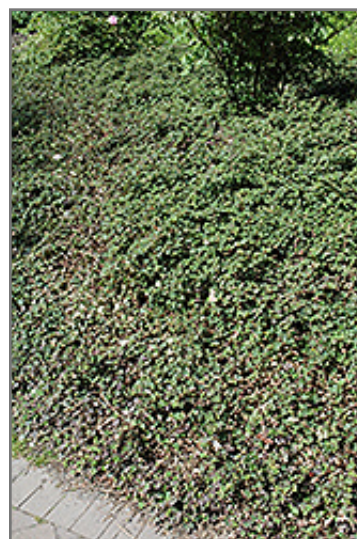
Formosan Carpet Creeping Taiwan Bramble

Formosan Carpet Creeping Taiwan Bramble is recommended for the following landscape applications;