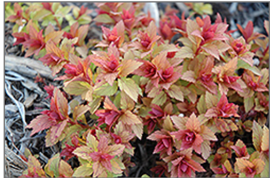
Magic Carpet Spirea foliage