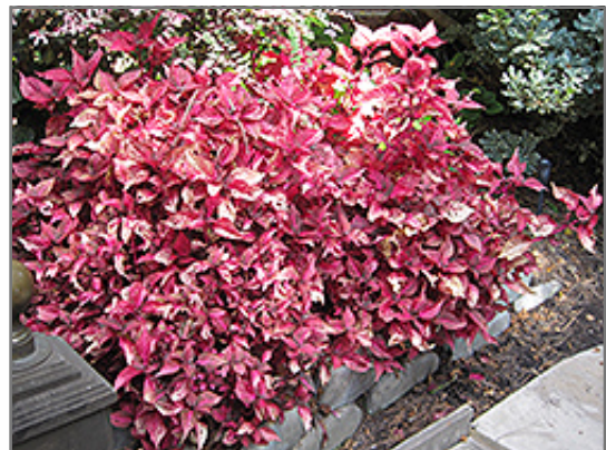
Blood Leaf