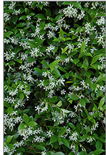
Confederate Star-Jasmine flowers