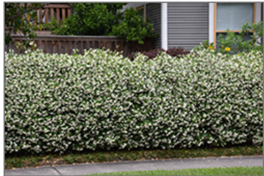
Confederate Star-Jasmine in bloom