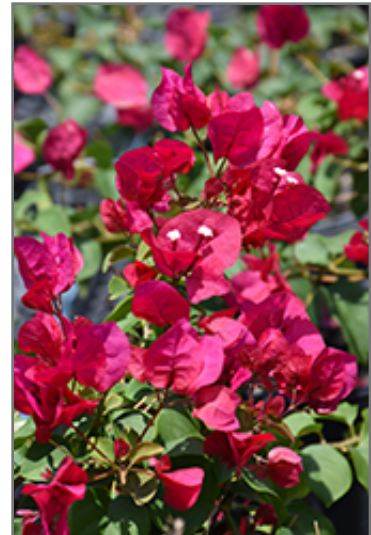
Barbara Karst Bougainvillea flowers

Barbara Karst Bougainvillea is recommended for the following landscape applications;