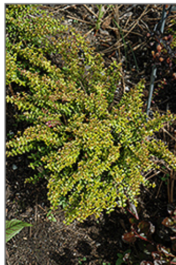
Twiggly Box Honeysuckle