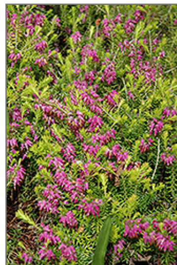
Myretoun Ruby Heath flowers