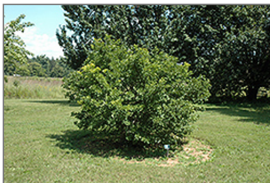
Jade Butterflies Ginkgo