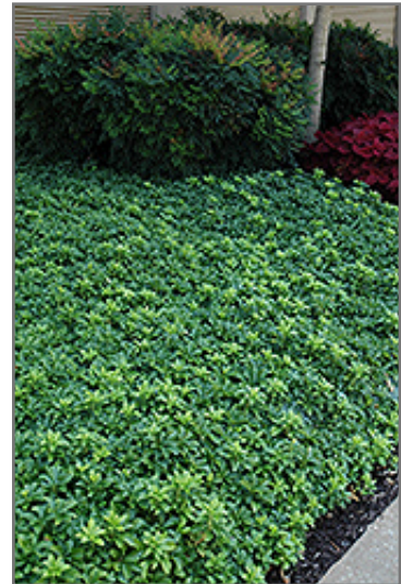
Green Sheen Japanese Spurge