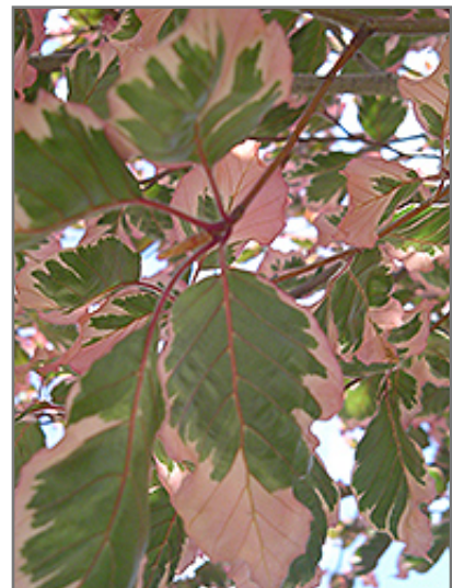
Tricolor Beech foliage