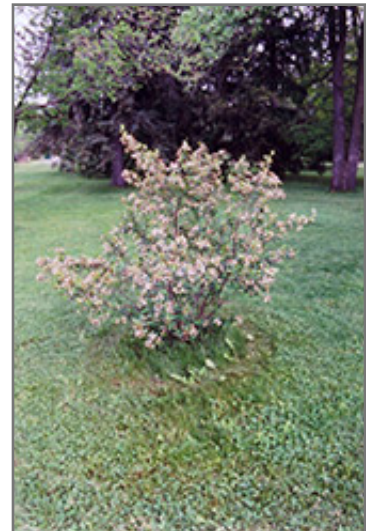
Black Chokeberry in bloom