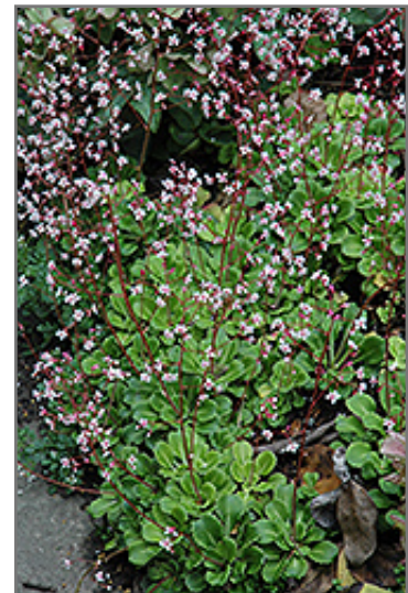
London Pride in bloom

London Pride is recommended for the following landscape applications;