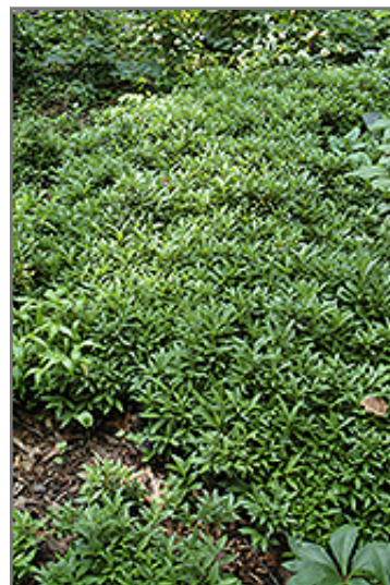
Dwarf Sweet Box

Dwarf Sweet Box is recommended for the following landscape applications;