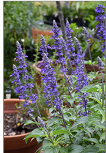
Mystic Spires Sage flowers

Mystic Spires Sage is recommended for the following landscape applications;