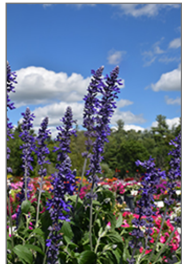
Mystic Spires Sage flowers