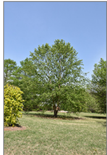
Dura Heat River Birch

The Original Family-Owned Garden Center 4320 Bridgeboro Road Moorestown, NJ 08057 Garden Center: (856) 461-0567 Landscaping: (856) 461-3359