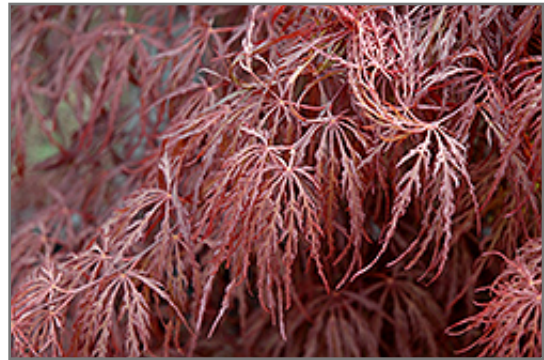
Crimson Queen Japanese Maple foliage

Crimson Queen Japanese Maple is recommended for the following landscape applications;