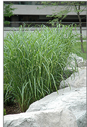
Zebra Grass

The Original Family-Owned Garden Center 4320 Bridgeboro Road Moorestown, NJ 08057 Garden Center: (856) 461-0567 Landscaping: (856) 461-3359