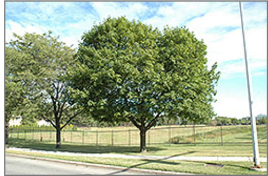
Norway Maple