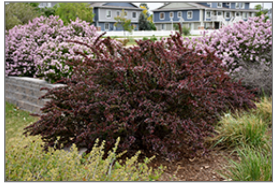
Red Leaf Japanese Barberry

Red Leaf Japanese Barberry is recommended for the following landscape applications;