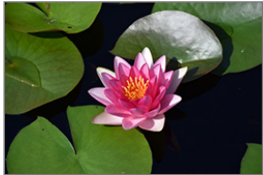
Attraction Hardy Water Lily flowers