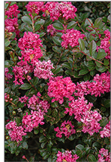
Pocomoke Crapemyrtle flowers

Pocomoke Crapemyrtle is recommended for the following landscape applications;