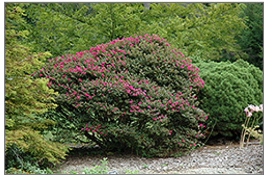
Pocomoke Crapemyrtle in bloom

The Original Family-Owned Garden Center 4320 Bridgeboro Road Moorestown, NJ 08057 Garden Center: (856) 461-0567 Landscaping: (856) 461-3359