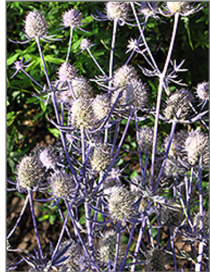
Jade Frost Variegated Sea Holly flowers

Jade Frost Variegated Sea Holly will grow to be about 8 inches tall at maturity extending to 24 inches tall with the flowers, with a spread of 15 inches. When grown in masses or used as a bedding plant, individual plants should be spaced approximately 12 inches apart. Its foliage tends to remain low and dense right to the ground. It grows at a medium rate, and under ideal conditions can be expected to live for approximately 10 years. As an herbaceous perennial, this plant will usually die back to the crown each winter, and will regrow from the base each spring. Be careful not to disturb the crown in late winter when it may not be readily seen!