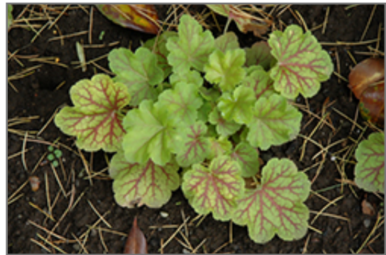
Electric Lime Coral Bells