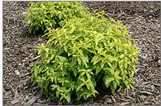
Sunshine Blue Caryopteris

Sunshine Blue Caryopteris is recommended for the following landscape applications;