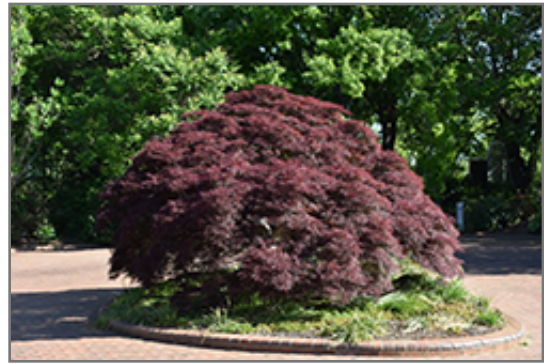
Purple-Leaf Threadleaf Japanese Maple

Purple-Leaf Threadleaf Japanese Maple is recommended for the following landscape applications;